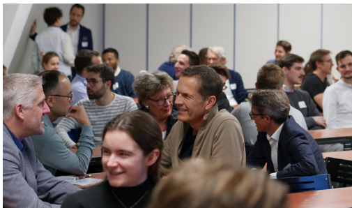
“Mentoring program”: Sharing experiences with students