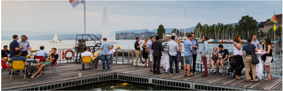
“Summer party”: Social event at the lake