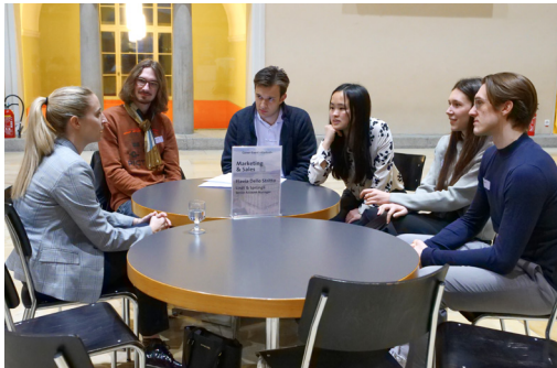
“Klartext”: Alumni give an insight into their professions