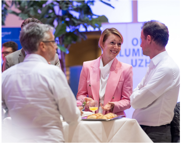
“Homecoming”: Back to university