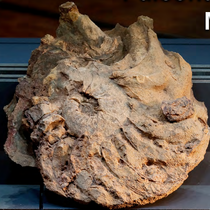
Agoniatites nodiferus , ein Agoniatit frühes Elveo, mittleres Devon Tafilaat, Marokko

Im mittleren Devon waren die Ammonoideen erstmals häufig und wiesen zeitweise eine hohe Diversität auf. Einzelne Arten wie Pinacites jugleri waren weit verbreitet und sind daher gute Leitfossilien. Einige hatten breite und niedrige Windungen und wurden bis über 30 cm gross, wie z.B. Cabrieroceras crispiforme , ein typischer Vertreter der Anarcestiden. Andere hatten schmale und hohe Windungen wie Agoniatites nodiferus , ein typischer Vertreter der Agoniatitiden. Viele dieser Ammonoideen starben bereits an der Grenze vom mittleren zum späten Devon aus.