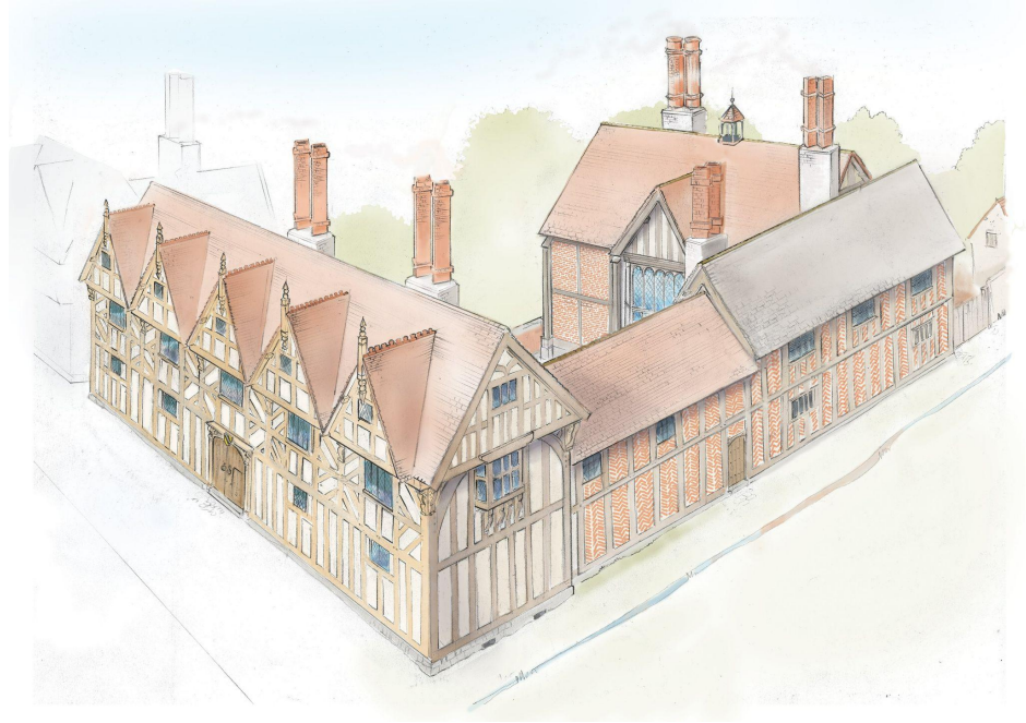
Shakespeare's New Place