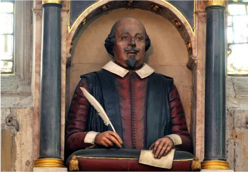
Shakespeare's grave effigy in the Holy Trinity Church, Stratford-Upon-Avon

Source: The Guardian , "Self-satisfied pork butcher"