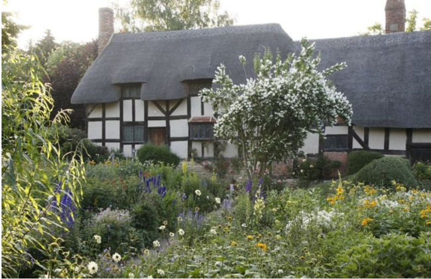
Anne Hathaway's Cottage