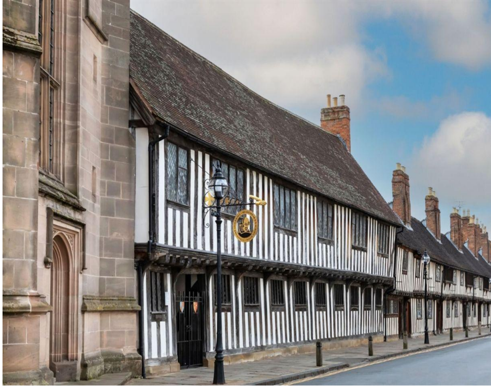
Shakespeare's school