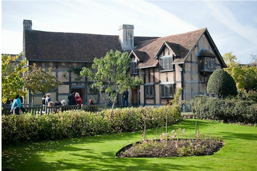
Shakespeare's birthplace, situated in Henley Street

William Shakespeare, also known as «The Bard of Avon» or «The Bard», worked during his 56 years of life as a poet, playwright, actor and dramatist. He was born in Stratford-upon-Avon in April 1564 and died in his beloved hometown in April 1616. He grew up in the house now known as «Shakespeare's Birthplace», located on Henley Street.