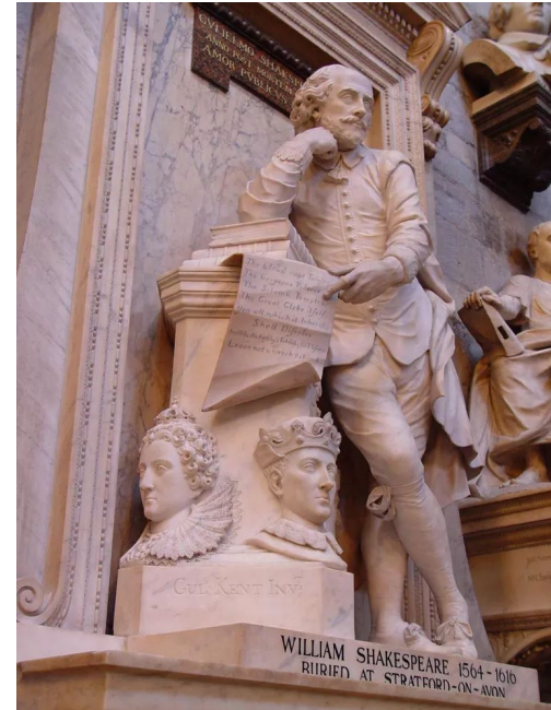
Shakespeare's Memorial in the Westminster Abbey, London