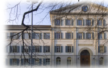
Civil and Criminal Courts of the Cantons