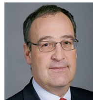
Guy Parmelin President 2021 Federal Department of Economic Affairs, Education and Research