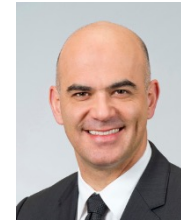
Alain Berset Federal Department of Home Affairs