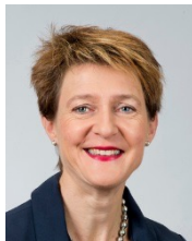
Simonetta Sommaruga Federal Department of Transport, Communication and Energy