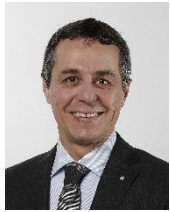
Ignazio Cassis Federal Department of Foreign Affairs