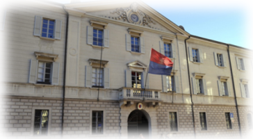
Federal Criminal Court