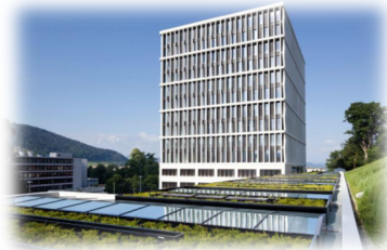
Federal Administrative Court