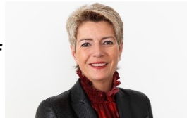
Karin Keller-Sutter Federal Department of Justice and Police