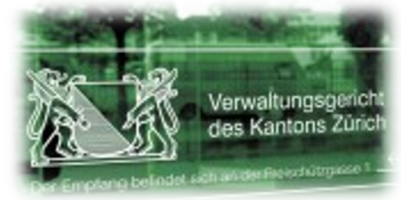
Administrative Courts of the Cantons