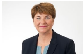
Viola Amherd Federal Department of Defence, Civil Protection and Sport