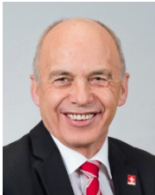
Ueli Maurer Federal Department of Finance