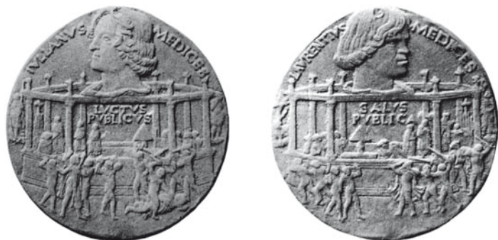
Fig. 5 Bertoldo di Giovanni, Medal commemorating the Pazzi Conspiracy and the Assassination of the Medici , 1478, obverse and reverse, ø 6.6 cm.

during Easter mass (or when the cup with wine is raised, as Angelo Poliziano specifies in his description of the events). 24 While the murdered Giuliano was honored by the inscription of luctus publicus (public sorrow), Lorenzo's figure was accompanied by the term salus publica (public salvation). This combination occurs mechanically as a comparison thanks to the features of the double-sided medal as a reversible visual medium offering two overlapping images. In this way,