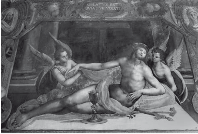
Fig. 3 Alessandro Allori, Christ Veiled by Angels , 1579–1580, mural oil painting, Florence, Palazzo Salviati.

However, our interpretation of the cloth motif in Allori's Roman painting is so far based on the artistic identity of an artist consciously developing his art and unwaveringly arriving at the moment of iconographic invention. In order to leave such evolutionary assumptions aside, let us, instead, ask about possible external factors that might