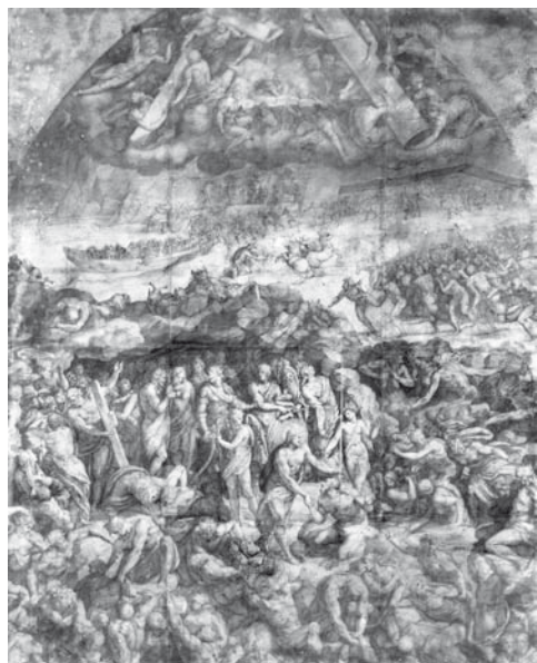
Fig. 1 Alessandro Allori, Harrowing of Hell , 1572–1578, pencil drawing, 1.52 × 1.26 m, Florence, Galleria degli Uffizi, Gabinetto dei Disegni e delle Stampe, inv. 1787E.

stantial compositional modification: instead of the figure of Christ – known from Michelangelo’s model and hence expected by the viewer –, a cup held by angels and a banderole with an abbreviated quotation from the Book of Zacharias 9,11 appears here: «in sanguine eduxisti vi[n]ctos», typologically referring to the Eucharist. 3 The Savior’s bodily presence was marked in the lower part of the composition