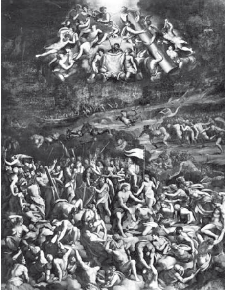
Fig. 2 Alessandro Allori, Harrowing of Hell , 1572–1578, oil painting on wood, 1.65 × 1.27 m, Rome, Galleria Colonna.

visual potential is in this way based on the temporary replacement of the person of the Savior as a permanently enthroned Judge. Significantly, previous studies published thus far have been silent about the origins of this extraordinary textile figure. On the one hand, the appearance of an autonomous bloodstained cloth as a carrier of presence can be interpreted in terms of artistic practice. The numer-