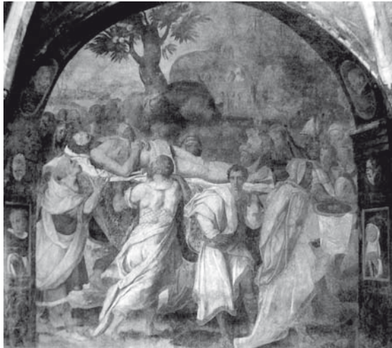
Fig. 4 Alessandro Allori and Giovanni Maria Butteri, Christ Carried to the Tomb , 1582–1584, fresco, Florence, Santa Maria Novella, Chiostro Grande.

have motivated Allori's use of this pioneering motif of the autonomous bloodstained cloth in an Christological context. Following to some extent Michael Baxandall, who did not believe in artists' autonomous identity and who analyzed images according to the model of «naïve but skeptical intentionalism», it is worth examining Allori's painting in the light of contemporary discourse on representation. 9 According