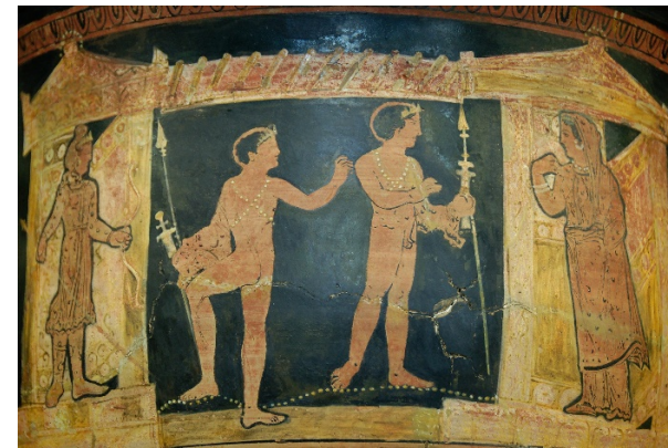
Orestes and Pylades among the Taurians. Detail from a Campanian red-figure krater, ca. 330 BC–320 BC. From Italy. Louvre K 404 (public domain)